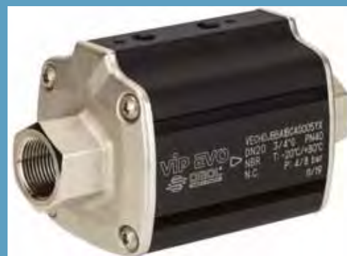
The VIP EVO, which is the 'evolutionized' version of the VIP valve

The pneumatic coaxial valve VIP EVO is the evolution of the OMAL's VIP valve. The EVO is an interception valve (between pipe IN-OUT) with built-in control system. It works thanks to the internal movement of a piston supplied with air. At the end of its stroke (VIP EVO valve is an ON/OFF valve), the piston presses on the seat seal, stopping the fluid from flowing, or moves away from the seal, allowing the intercepted fluid to flow.